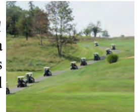
May the best team win!

The day was filled with fun, food, games, and GOLF! There were several contests for our participants — a custom three-hole putt-putt contest, longest drive contests for men and women, closest to the pin contests for men and women, and last, but certainly not least, the Honest award!